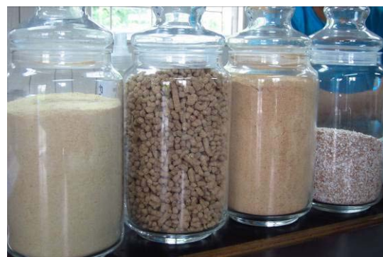
Pig/fish feed generated from organic waste