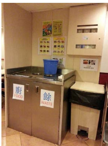
Food waste recycling corner in staff canteen