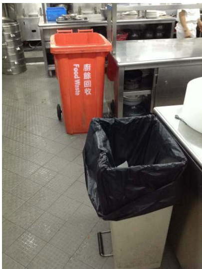
240L Food waste bin in Chinese Kitchen

By introducing food waste recycling, our waste to landfill is reduced significantly by about 30% and the waste recovery is also increased by more than 25%. Instead of throwing the organic waste into the landfill, they are now turned to some useful materials like fertilizers and animal feed, which help to ease the heavy burden on the landfill.