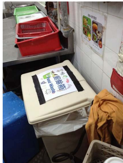
Small food waste recycling bin placed next to washing station