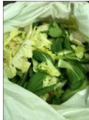
Vegetable trimmings are collected separately from waste