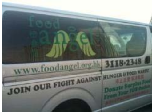
Food Angel pick s up the vegetable trimming from hotels