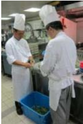
Chefs are trimming the vegetable at Chinese kitchens

This is an excellent example of a win-win situation for both the food donors and recipients. We learn that each “waste” can sometimes be valuable material to others and therefore we should always think twice before we throw.