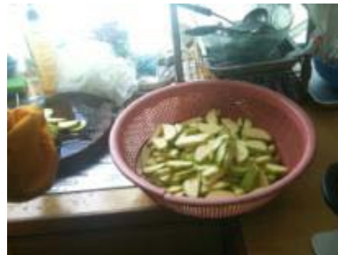
Prepare the fresh vegetables at Food Angel's kitchens for the needy