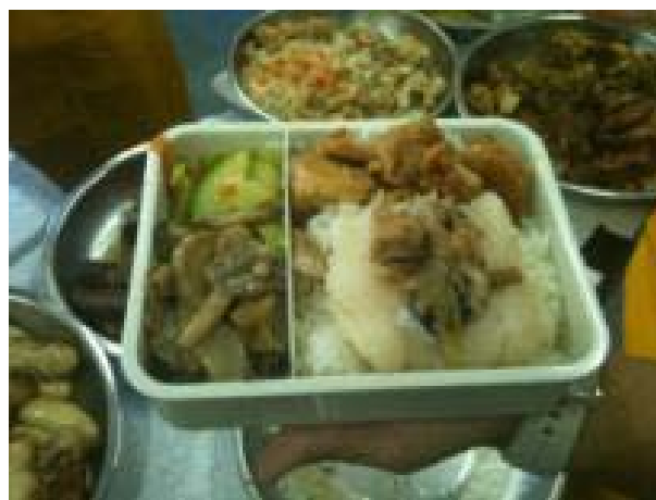
Final lunch boxes with balanced diet